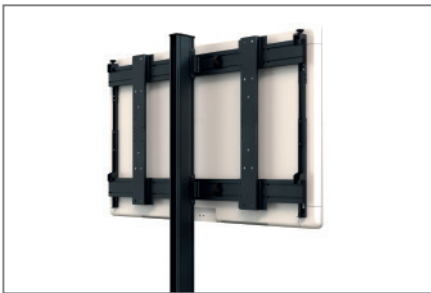
Cable routing along the rails